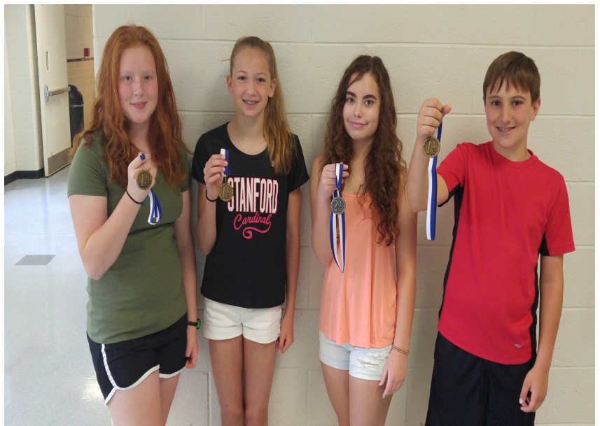
Literacy Explosion winners from Henley Middle School.

The location and date for 2017 Literacy Explosion will be announced this fall. All Virginia students in grades K-12 are invited to participate in this opportunity to share their language arts talents and abilities. Thank you to the students and teachers for their hard work. We celebrate each of you.