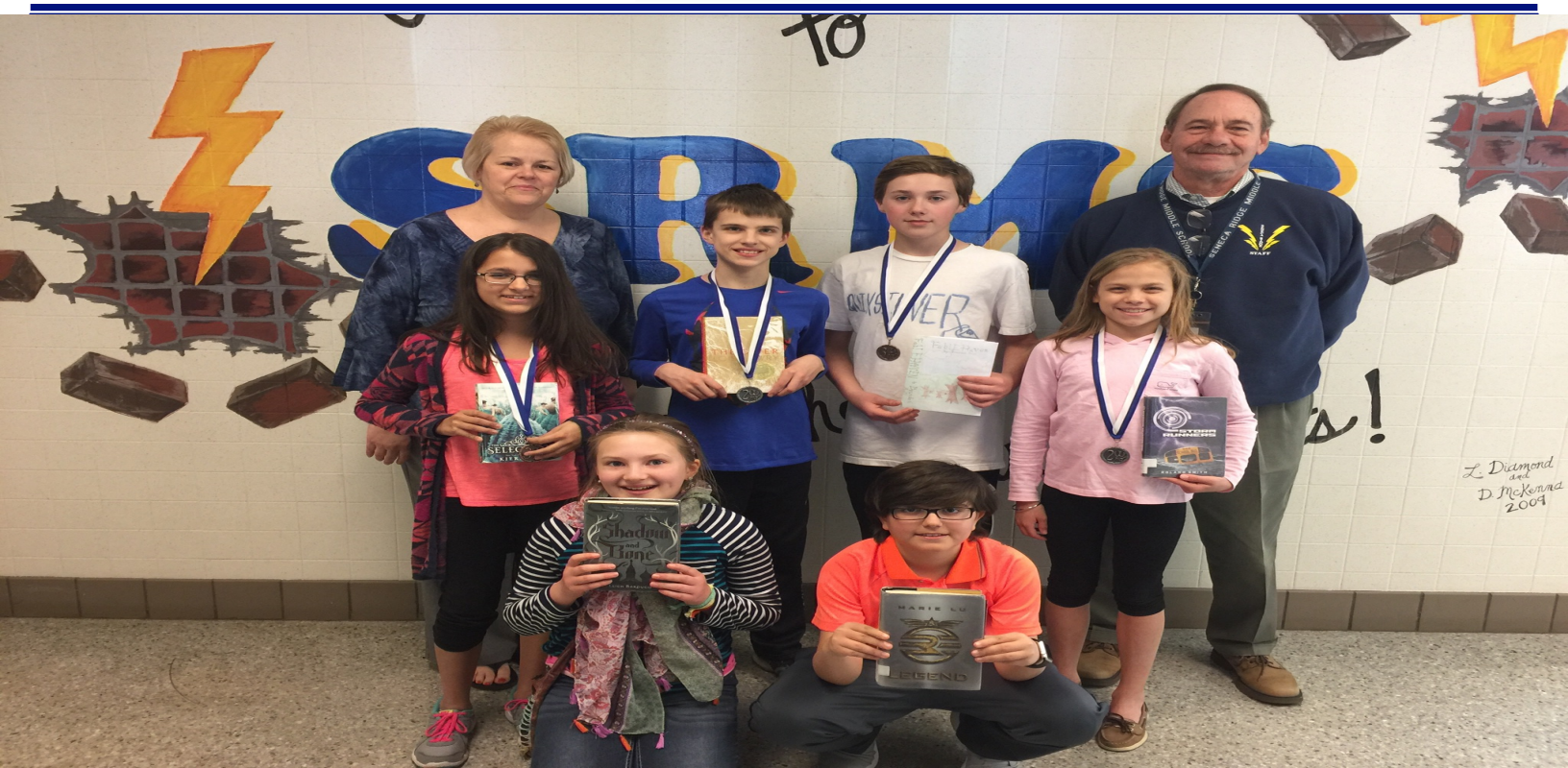
Literacy Explosion winners from Seneca Ridge Middle School.