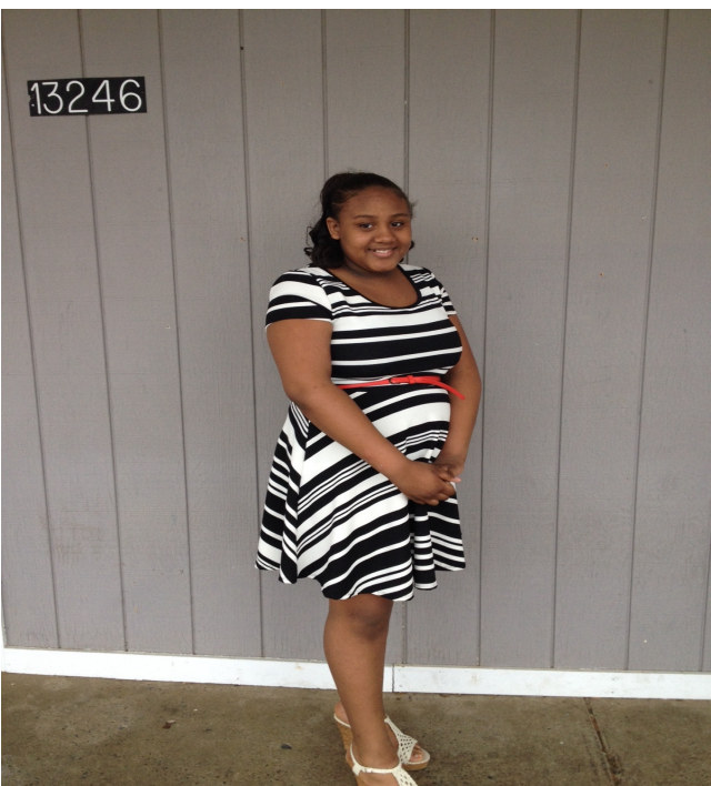
Literacy Explosion winner from Boushall Middle School.