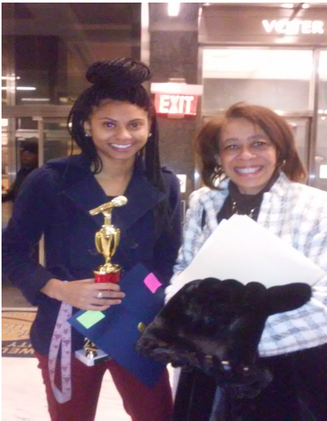
Literacy Explosion winner from George Wythe High School.