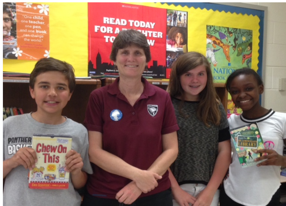
Literacy Explosion winners from Belmont Ridge Middle School.

Send us your submissions or students' work