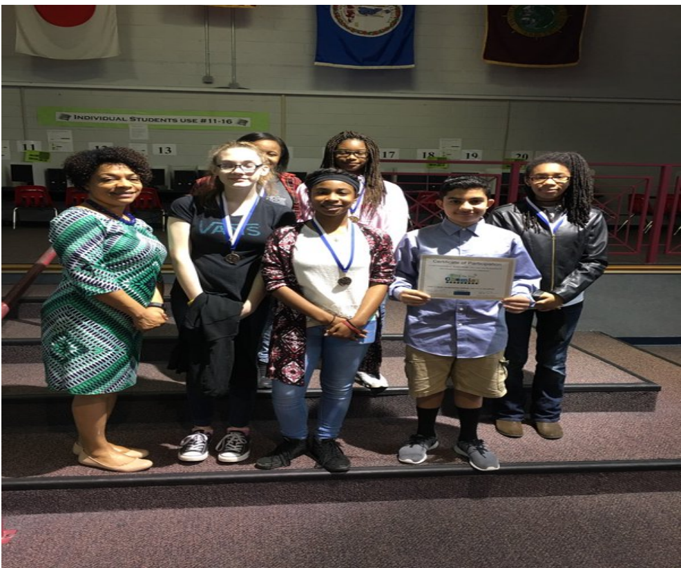
Literacy Explosion winners from Crittenden Middle School.